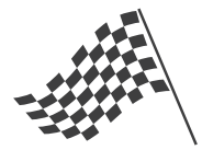
A1 GRAND PRIX