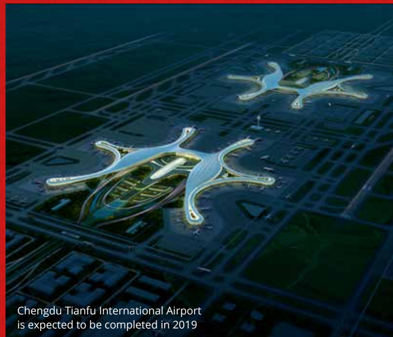
Chengdu Tianfu International Airport is expected to be completed in 2019