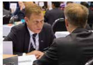
Three full days of pre-scheduled face-to-face meetings