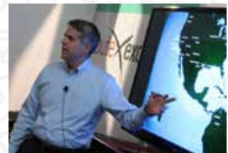
Route Exchange Briefings delivered by senior network planners