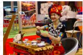
Networking Village featuring over 130 exhibitors