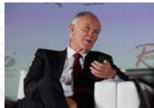
Three days of engaging and interactive conference content